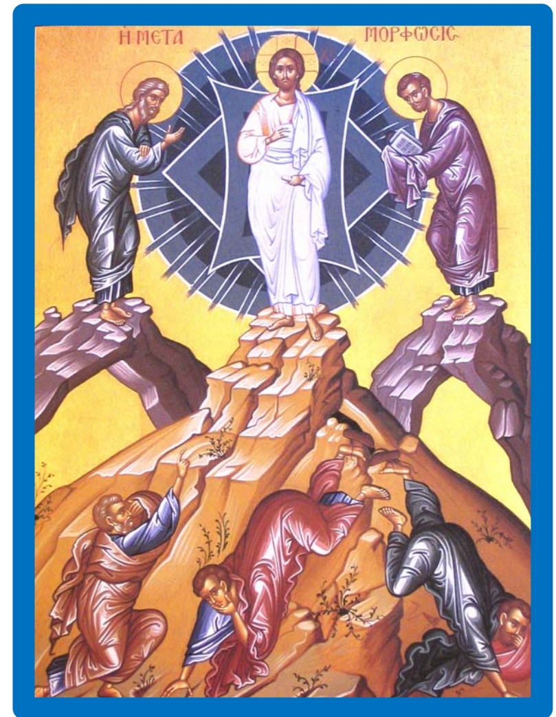
Transfiguration of Christ