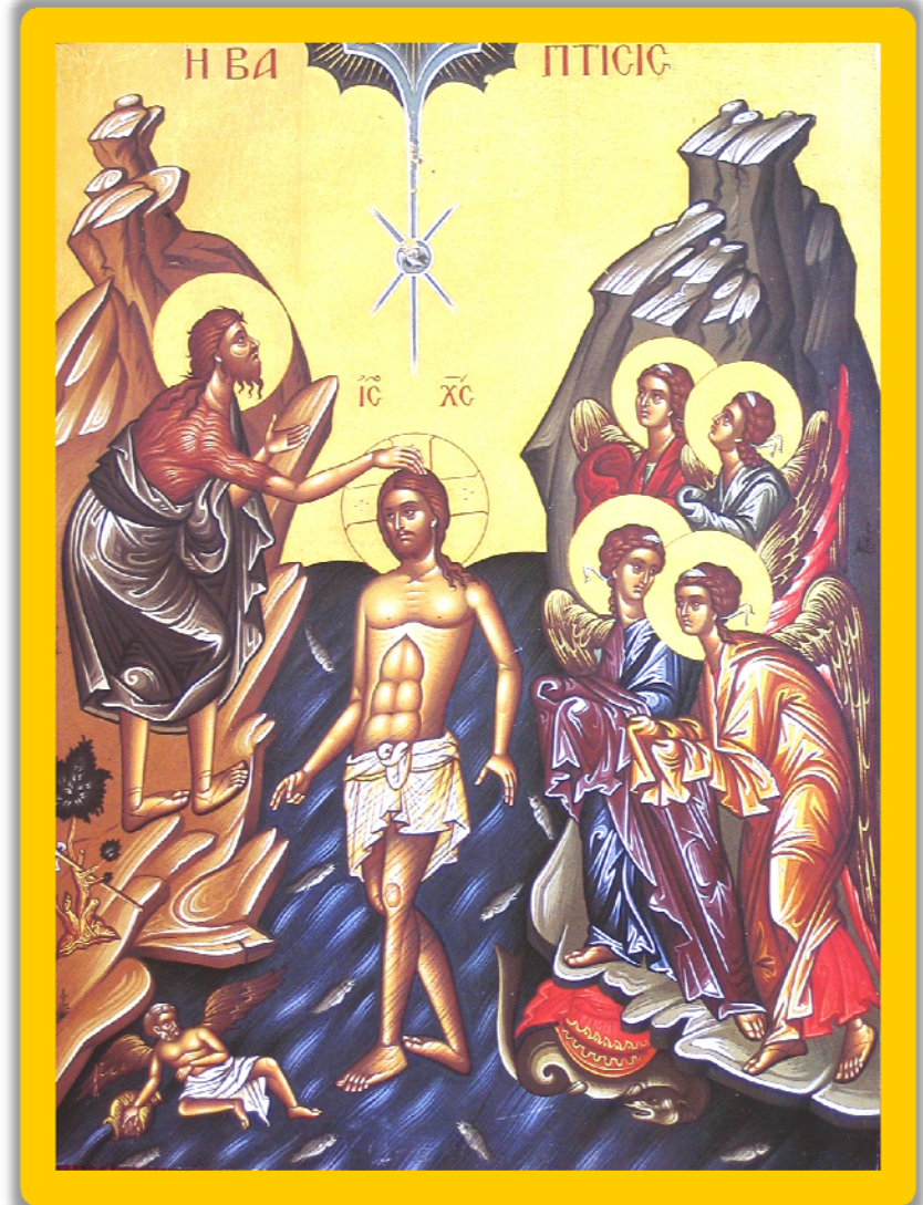
Baptism of Jesus

Originally, there was just one Christian feast of the shining forth of God to the world in the human form of Jesus of Nazareth . It included the celebration of Christ's birth, the adoration of the Wisemen, and all of the childhood events of Christ such as his circumcision and presentation to the temple as well as his baptism by John in the Jordan. There seems to be little doubt that this feast, like Easter and Pentecost, was understood as the fulfillment of a previous Jewish festival, in this case the Feast of Lights.