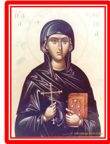
Great-Martyr Euphemia the All-Praised